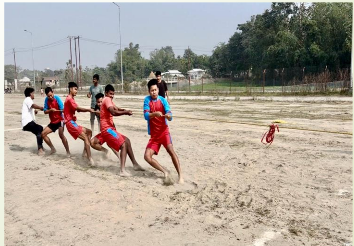
Games & Sports, Alaiaron Festival