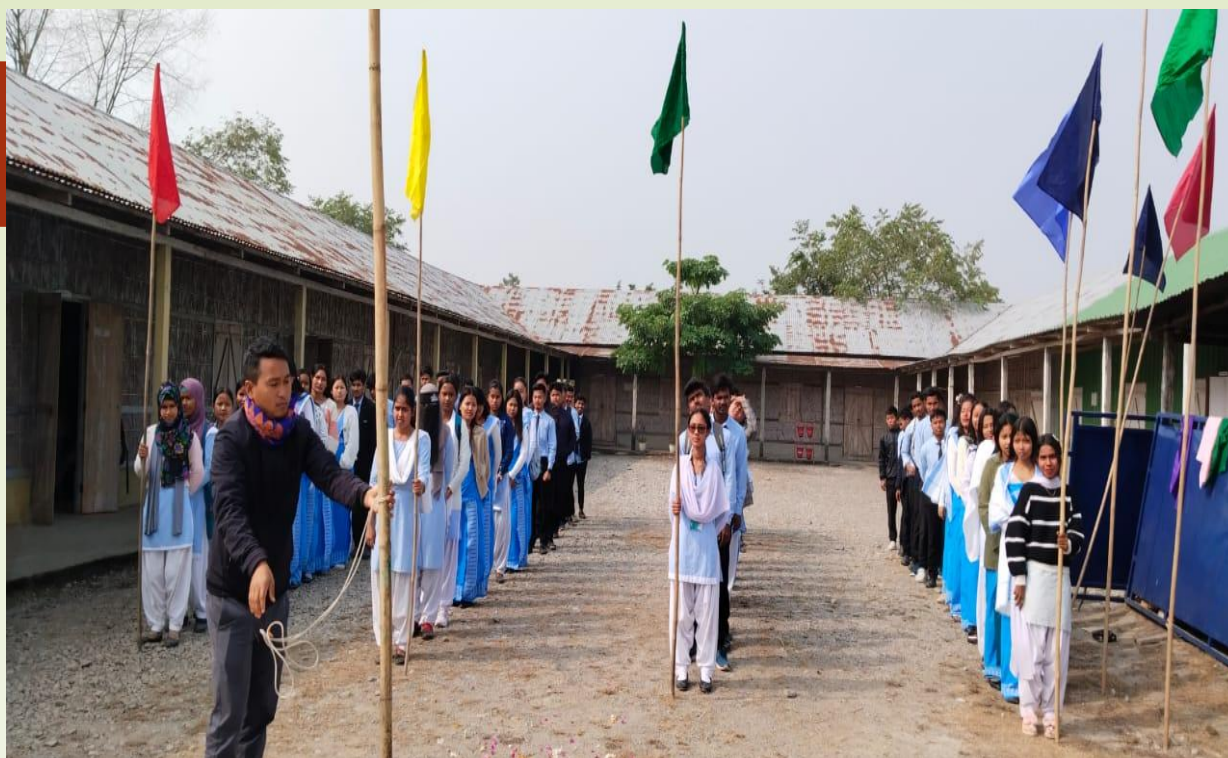
Inauguration of 8 th Annual College Week- Alaiaron Festival