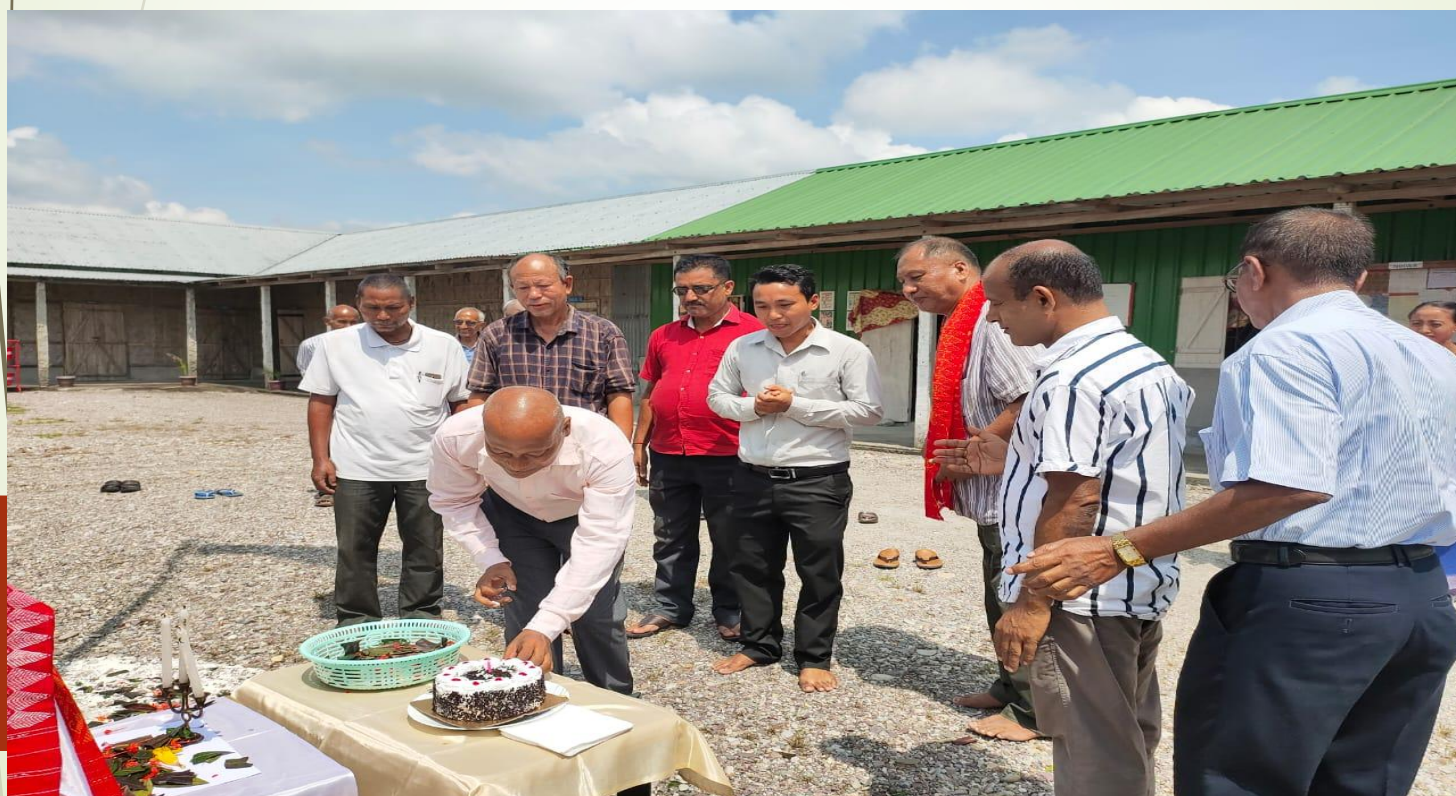
Celebration of the 6 th College Foundation Day