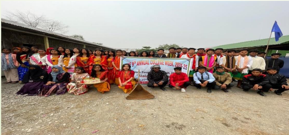
Annual College Week Cultural Rally