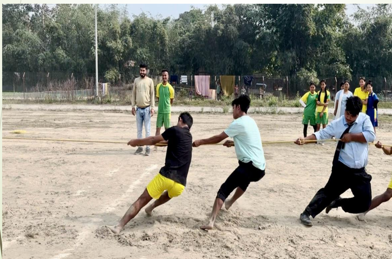
Games & Sports, Alaiaron Festival