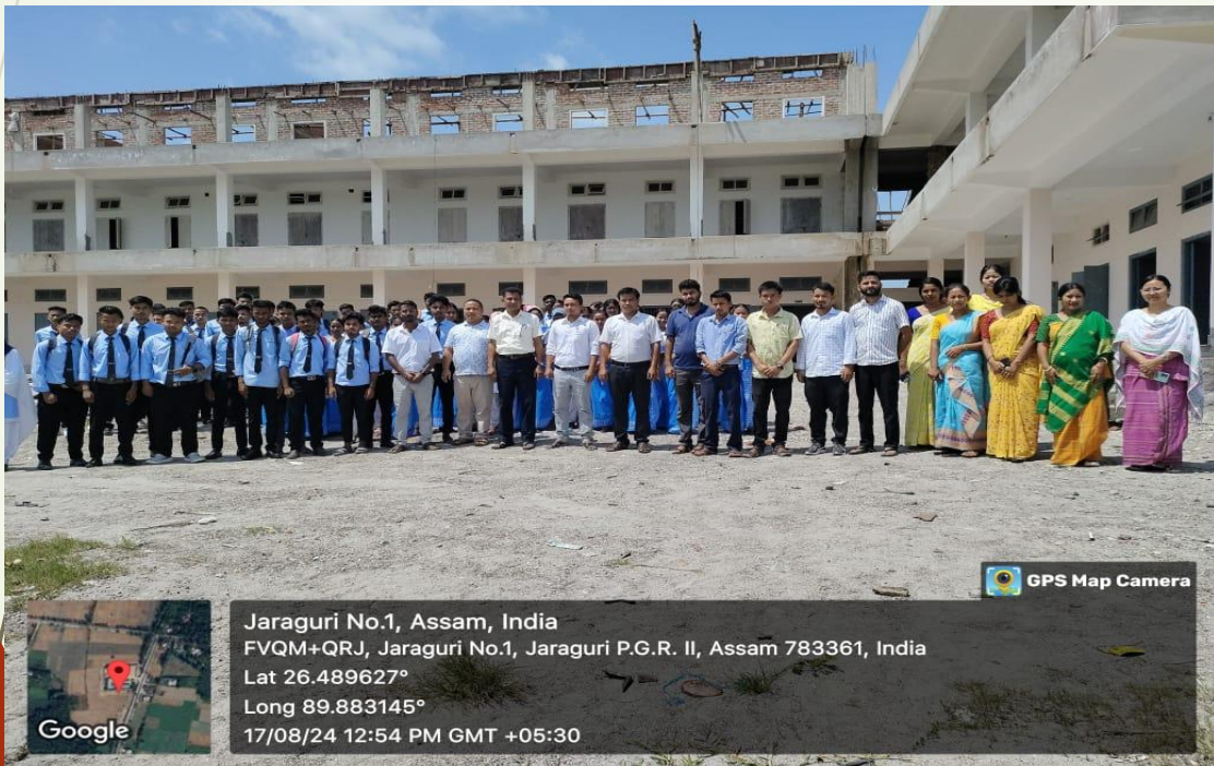
A Visit from Bodoland University